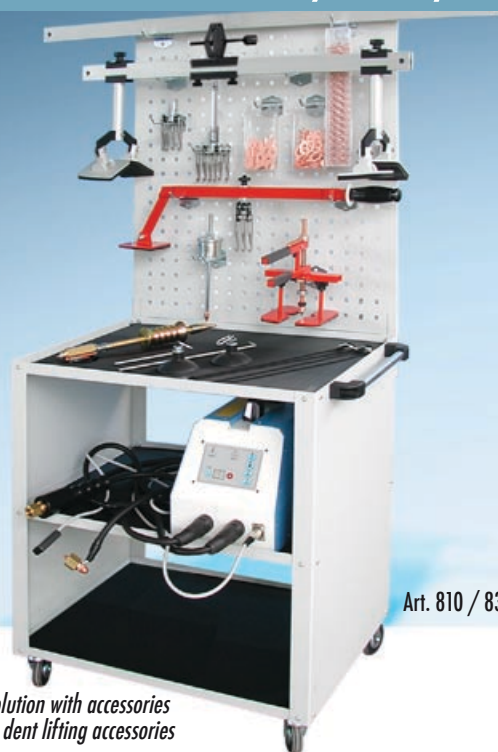
Art. 810 / 830